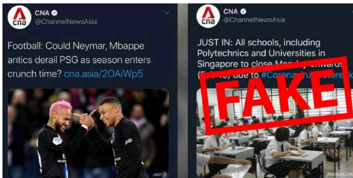
Example of Misinformation, Source: Lim, 2020

However, the biggest and most brazen attacks seem to have been launched by the Russian state authorities. An internal European Union briefing states that Russia's state-aligned media has launched a significant disinformation campaign against the West to worsen the impact of the coronavirus, generate panic and sow distrust (Emmott, 2020). "For the Kremlin, Covid-19 is an opportunity as well as a crisis," says Foxall (2020). "Russia has long sought to subvert the rules-based international order by creating fractures within Western societies, or taking advantage of pre-existing ones."