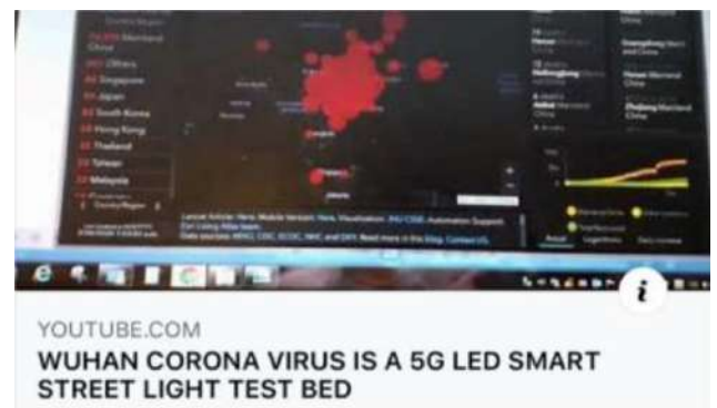
Example of misinformation, Source: Cellan-Jones, 2020

The flow of information has never been so weaponized as it has in recent years. Bradshaw & Howard (2019) found that the number of countries using misinformation for political purposes online had jumped from 28 in 2017 to 70 in 2019. The most prominent countries in their findings are now also involved in a misinformation campaign against their own citizens as well as against rival states.